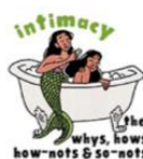
Intimacy: The Whys, Hows, How-Not's, and So-Not's