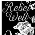
Rebel Well: A Starter Survival Guide To A Trumped America