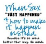
When Sex "Just Happened" (And How to Make It Happen Instead)