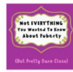
Not Everything You Wanted To Know About Puberty (But Pretty Darn Close)