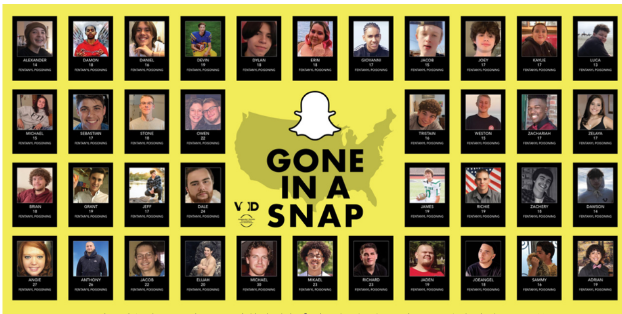
A few of the teens and young adults lost to fentanyl poisoning and a Snapchat Stories Drug Menu